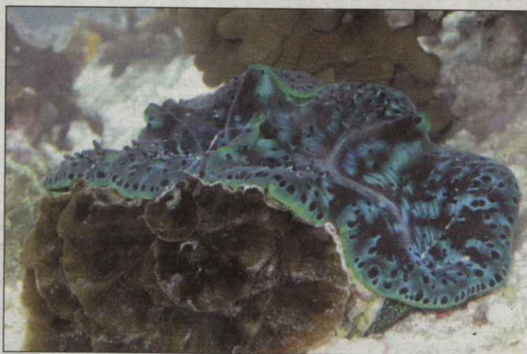
Amazing colours, amazing creatures